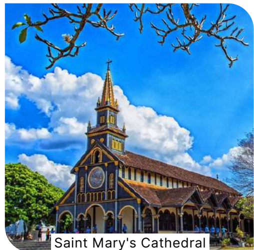
Saint Mary's Cathedral