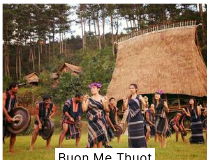
Buon Me Thuot

Sunday: 05:30, 08:30, 16:00, 17:30, 19:00