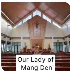
Our Lady of Mang Den