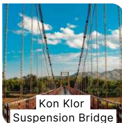
Kon Klor Suspension Bridge