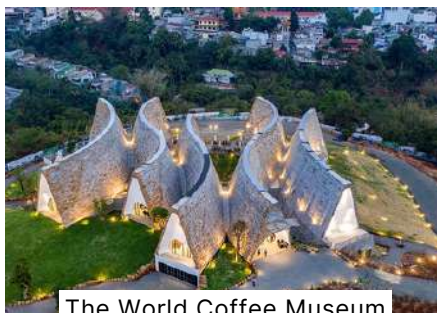
The World Coffee Museum