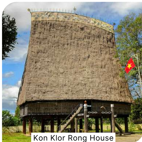
Kon Klor Rong House